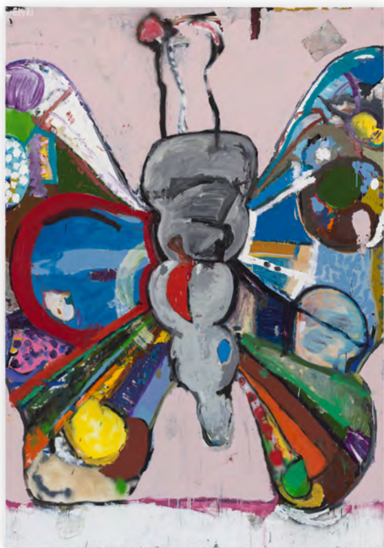
Eddie Martinez's 'Bufly #4 (Big Body)' (2021). Oil, acrylic, enamel, spray paint, oil stick, baby wipe, and debris on canvas. 120 x 84 x 1 1/4 inches. © 2022 Eddie Martinez / c/o Artists Rights Society (ARS), New York. Courtesy of the artist and Blum & Poe, Los Angeles/New York/Tokyo.

Eddie Martinez: I genuinely think calling an artist self-taught is a market factor. I am not self-taught or an outsider in the way most people are familiar with those terms. I had a little bit of schooling as an artist, but I just couldn't do it. I kept dropping out and eventually gave it up altogether. Rather than a "self-taught artist," I think a more appropriate label for me would be an "instinctual painter." I work on insight and intuition.