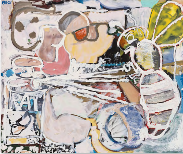
Eddie Martinez's 'Raid Painting #2 (Gotcha)' (2021). Oil, acrylic, spray paint, and enamel on canvas. 60 x 72 x 1 1/8 inches. © 2022 Eddie Martinez / c/o Artists Rights Society (ARS), New York. Courtesy of the artist and Blum & Poe, Los Angeles/New York/Tokyo.

to completely obliterate it. But here, in my paintings, I use the technique of white paint to see what happens when what you're putting down as a second layer becomes the skeleton. The skeleton brings a whole new idea, composition, or approach to making the painting. Instead of just whiting it out and letting it be removed, the whiting out gives it a rebirth and a potential whole new path.